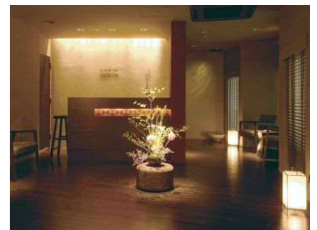
KAEDE SPA the Prince Hakone, Produced by JSPA

JSPA also engages in spa business promotion and has produced many spa salons by mobilizing the best experienced and talented professionals in the JSPA. We provide business consultation for spa salon management and operation in addition to business preparation and promotion. Please feel free to consult with us.